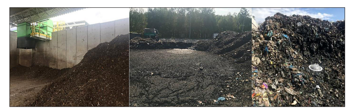
Fig. 1. Wastes subjected to composting/aerobic stabilisation - various solutions

chamber, are taken at the outlet of the casing. Each time after the shield has been placed on the surface of the source, wait until the pressure under the shield is balanced before taking the gas sample (Szyłak-Szydłowski, 2018). This time depends on the shape and dimensions of the shield (Naddeo et al., 2012).